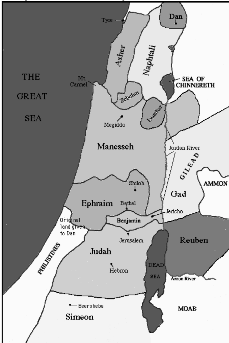
THE 12 TRIBES OF ISRAEL